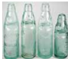
48. 4 CODDS 10oz Westbury, all over wear, A C Scott Auckland, light wear, Kia Ora Mineral Auckland, crate wear, internal haze, 6oz Alva Auckland, ding on side/edge