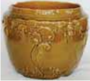
175mm tall by 220mm dia, moulded jardiniere attributed to Milton Pottery (marked example known), Rare, VG