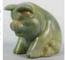
259. PIG #3 Crown Lynn modelled Pig, 85mm tall, green mottled glaze, VG