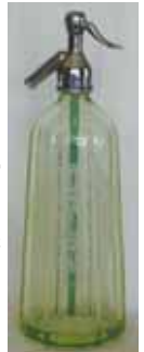
117. WRIGHT Light Green Syphon for Wright & Coy Christchurch, original top, Mint