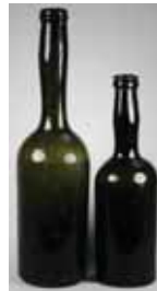
15. CONSTANTIA 305mm & 235mm tall Wine bottles, large one has all over wear, small is VG