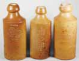
36. IMPRESSED GB'S 2 Salt Glazed impressed Gingers Beers, BBI23 Geo Dixon, potstone on side, plus BBI22 George Dixon VG, plus BBI5 J L Bacon Wellington VG, font looks different to book?