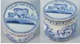
85. COW POT/BASE Blue print lid 69mm dia with 2 Cows and rural scene Veritable Moelle de Boeuf, with matching base 58mm tall, both VG