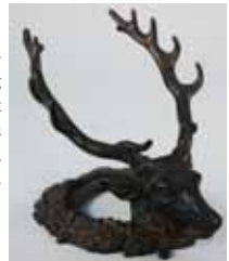
261. STAG A 14 pointer modelled Stag head as a pen rest, cast metal 120mm dia by 130mm tall, one point of antler broken, Good