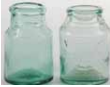
101. JAMS 2 2lb rolled top applies top Jams, Mennie & Dey & Phoenix, both VG