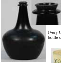
34. SHAFT GLOBE 180mm tall, Shaft & Globe, large pontil, good patina to body, approx. 60mm from rim down on neck restored (Very Good), a very rare early bottle circa 1690