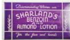
16. SHARLAND'S Celluloid advertising stand up sign, Sharland's Benzoin & Almond Lotion, a rare Auckland item, VG