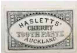
4. HASLETTS '95x60 Potlid, Hasletts' Cherry Toothpaste Auckland, 3 flange wall edge nibbles, light wear, Good