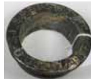
44. SPEIGHT Brass barrel bung, J Speight Dunedin, well used, Good