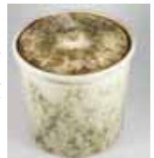
49. TIMARU ½ Gal lidded storage jar, mottled glaze, not marked, VG