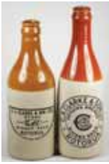
1. CLARKE 2 Ginger Beers BB58 & BB59, both VG