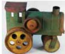
228. HERCULES Hercules New Zealand made Steam Roller, light wear, original sticker, VG