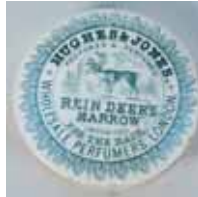
114. REINDEER 85mm dia Green printed Potlid, Hughes & Jones Wholesale Perfumers London Reindeers Marrow for the Hair, Great picture of a Reindeer in woods, prof repair to chip on flange wall, Very Rare, Very Good