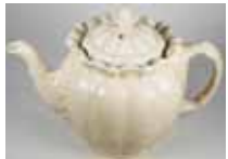
17. TEAPOT Temuka Potteries Teapot, signed TN Lovatt, Rare, VG