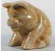
248. PIG #2 Crown Lynn modelled Pig, 85mm tall, tan mottled glaze, VG