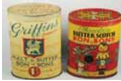
35. GRIFFINS Pair colourful sweet tins from Griffins Nelson, light wear Good