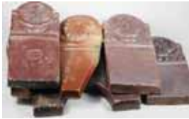
3. GARDEN TILES Assorted Auckland potters Garden Edging Tiles, Boyd & NZ Brick, Good