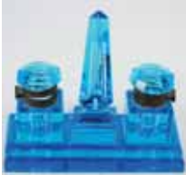
250. DESK SET 4 piece set 135mm wide x 70mm deep x 105mm tall, 2 inkwells and a central column on base, bright blue glass, minor chip to rear of base, VG