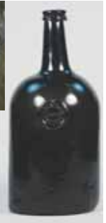
43. WATSON 310mm tall, very large double magnum sealed wine, I Watson Esq Bilton on applied seal, minor lip nibble polished and chip to top of seal, Very Rare