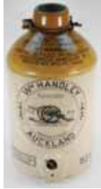
215. HANDLEY 1 Gal stone jar, Wm Handley Auckland, Canon tm, repair to rim edge and hairline to side, Good