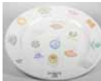
6. TRADEMARKS Interesting plate 240mm dia, with various trial marks in diff colours for a salesman to show new customers, no pm, Rare, VG