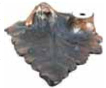
115. NOUVEAU 280mm long x 190mm wide x 50mm tall, cast metal inkwell with flowing leaf design with a lady's head forming the well, hinged cap absent, VG