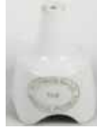
256. HUTCHINSON 85mm tall ceramic pie funnel for Hutchinson Bros The Universal Providers (Auckland), VG