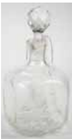
254. DCL 165mm tall pinch waisted decanter, enamelled print DCL Scotch Whisky/ Caledonian Liqueur, pontil and applied handle, VG