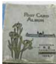
262. POSTCARD A 1906 ChCh Exhibition Post Card Album, with some very interesting cards inside, VG