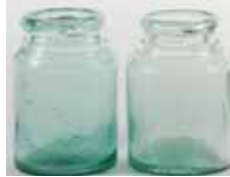
112. 2 JAMS 2 x 2lb roll top Jams, Excelsior & Southern Cross, both BGW maker, Good