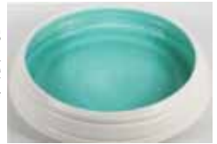
113. STEPHENS 200mm dia x 40mm tall float bowl marked O C Stephens, VG