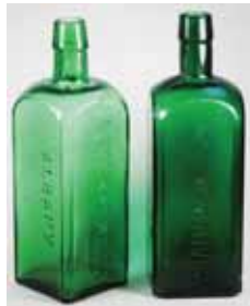
13. TOWNSEND Pair of Dr Townsend Albany NY Sarsaparilla bottles, both VG