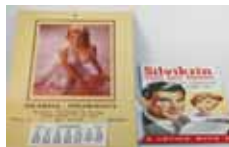
255. AKAROA 1963 Calendar for Akaroa Pharmacy and trade card for Silvikrin, both VG