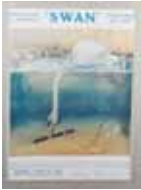
5. SWAN Advertising A4 print in mount for Swan Fountain Pens, VG