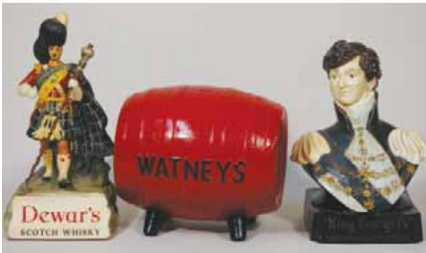
7 8 9