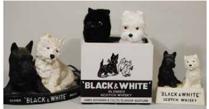
10 11 12