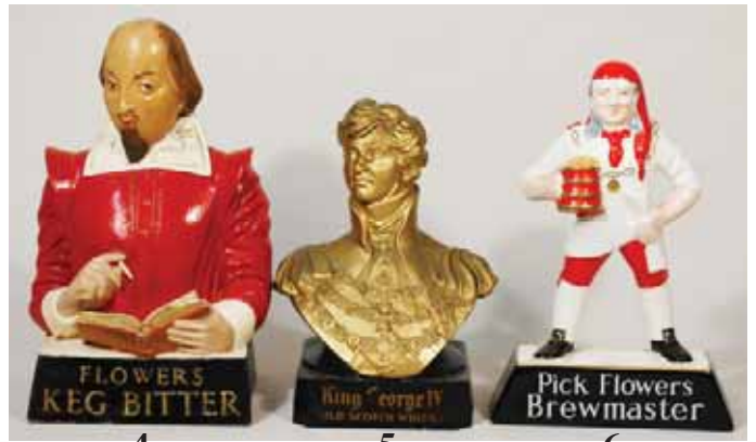
4 5 6