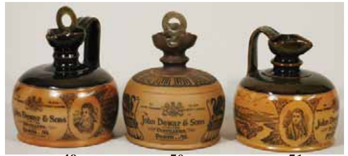
49 50 51

53. FINEST OLD 11ins tall to top of original stopper, words in relief "FINEST OLD HIGHLAND