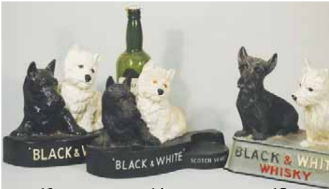
13 14 15