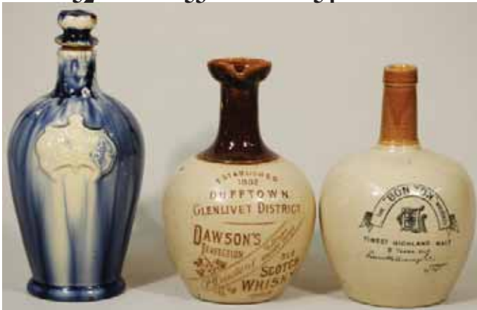
61 62 63

46. KING GEORGE IV 10.5ins tall to top of stopper, with handle, all over cobalt blue, "KING GEORGE IV", Royal Doulton pm, Mint. R$75 (80 – 120)