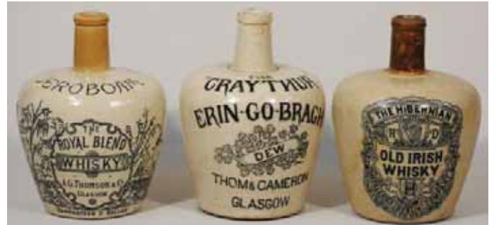
58 59 60