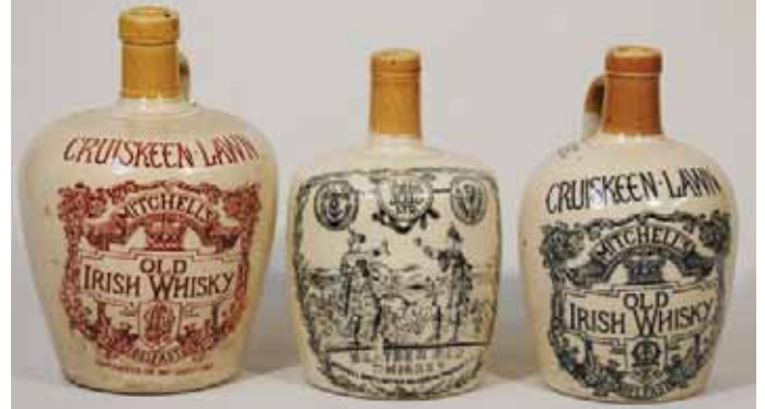
55 56 57