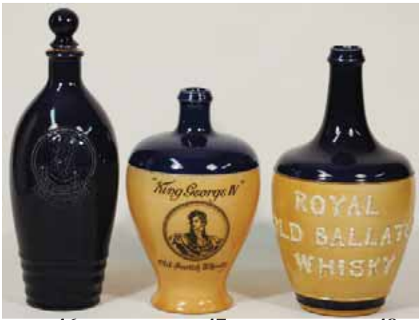
46 47 48