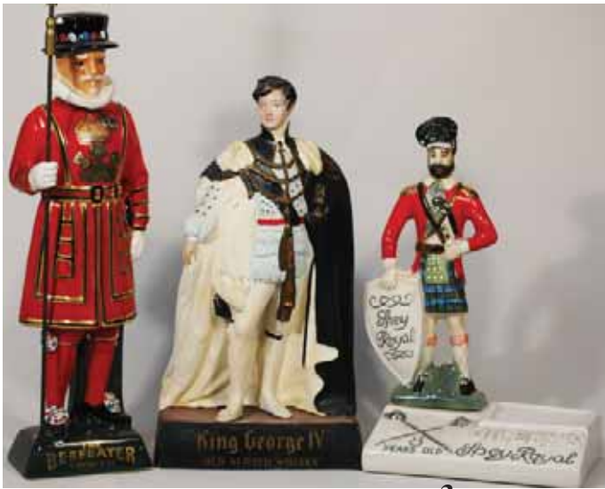
1 2 3