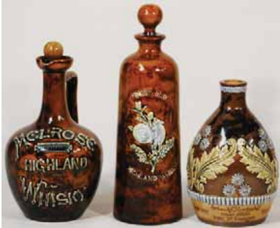
52 53 54