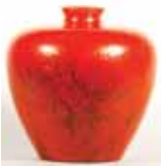
83. PILKINGTON 130mm tall bright tangerine glazed pot made by Pilkington Pottery, VG