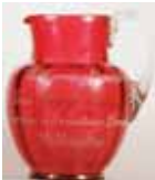
296. ROBINSON 10oz apple green Internal J Robinson Christchurch, Bicycle tm, original stopper, VG R$50