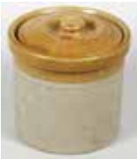
279. STOURWARE 75mm tall 75mm dia travellers sample of a lidded storage jar, Stour Ware marked, VG R$50