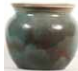
289. JONES 110mm tall green brown mottled glazed Vase by Olive Jones, VG