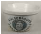
54. FATHER XMAS 90mm tall x 150mm dia, large size Aulsebrook's Xmas Puddings, rim edge ding and light internal stains, Good R$300