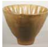
305. JELLY 130mm tall, Jelly Mould, Milton Pottery marks to base, an early item, marks date to the Graham & Winter era, rim edge chip and staining, Good, R$200