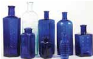
51. POISON 8 assorted cobalt blue (7) and aqua (1) Poison bottles, VG (8)