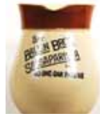
57. BALLINS 170mm tall, early stoneware jug for Ballin Bros Sarsaparilla, professional rim edge repair, VG, R$175