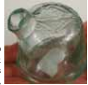
58. BLACKWOOD 50mm tall aqua shear top ink for Blackwood London, has registration diamond to shoulder, VG