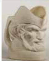
53. CROWN LYNN 165mm tall bisque pottery character jug for McCallum (whisky), marked 2119 to base, a rare variation of this jug, VG