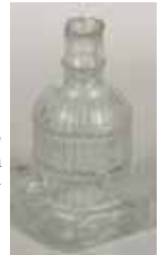
284. BIRDCAGE 80mm tall clear glass shear top ink in form of a Birdcage, VG