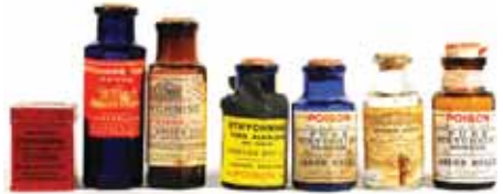
300. STRYCHNINE 7 different labelled Strychnine Poison bottles, VG (7)