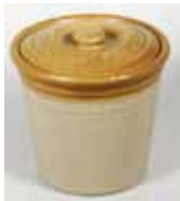
276. STOURWARE 80mm tall 90mm at widest tapered travellers sample of a lidded storage jar, Stour Ware marked, VG R$50