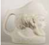
293. CROWN LYNN 180mm tall bisque pottery character jug for McCallum (whisky), marked 2119 and artist signature to base, a rare variation of this jug, VG