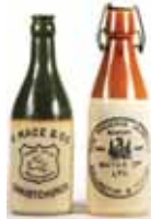
274. GB'S 2 Ginger Beers BB222 H Mace Christchurch, neck repairs plus BB263 Phoenix swing stopper, VG (2)