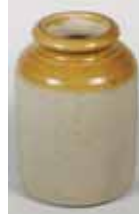
59. STOURWARE 90mm tall, travellers sample storage jar, marked Stour Ware, VG R$50