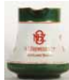
285. NZ BREWERIES 140mm green top & bottom china water jug NZ Breweries Auckland Branch Imperial Pale Ale/Stout to sides, James Green Nephew maker, VG